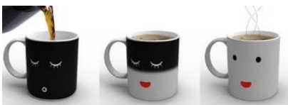
Thermochromic and photochromic paint